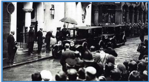
King George V outside the London Insurance Hall, 1912