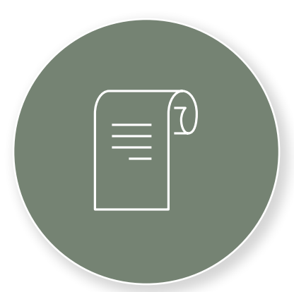
The Original Charter of 5 February 1912. Page 3