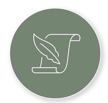
The Supplemental Charter of 27 January 1987. Page 4